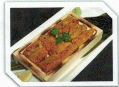
2. 焼きうに Grilled Uni 32