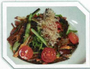
13.サーモンスキンサラダ Salmon Skin Salad 12