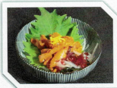
5. うにみそイカ漬け Uni Miso Ika Zuke 9