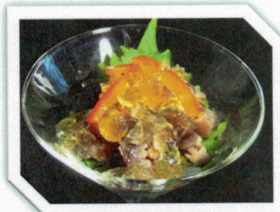
7. なまこの酢の物 Vinegared Shutou Sea Cucumber 9