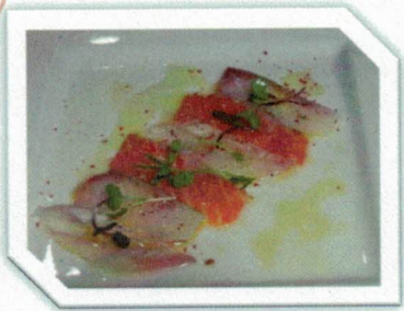
11.カルパッチョ(ホタテ・サーモン・鯛) Carpaccio (Scallop, Salmon, Red Snapper) 18