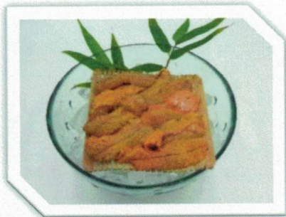
3. 無添加塩水うに刺身 Ensui Uni Sashimi (Additive Free) 32