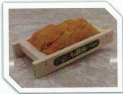
1. 無添加生うに(木箱入り) Fresh Uni in Wooden Tray (Additive Free) 32