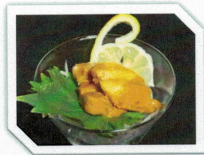
4. 雲丹酒盗ルイベ Ruibe 9