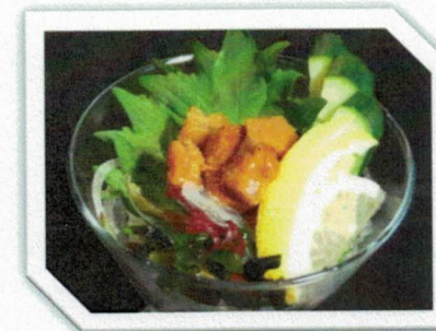
6. 雲丹酒盗数の子入り (柚子胡椒味) Uni Shutou with Herring Roe Yuzu Chili Flavor 9