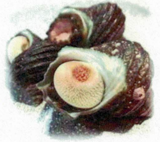
地元産さざえ Locally caught Turban Shell $15