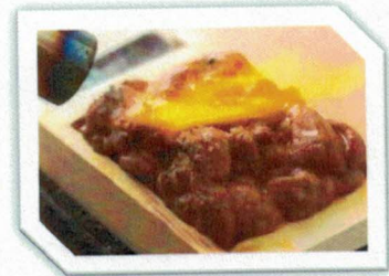
2. 無添加塩水うに刺身 Ensui Uni Sashimi (Additive Free) 32