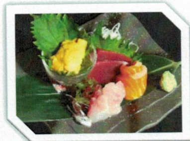
12. 刺身盛合せ (s)-3 点盛+うに Assorted Sashimi (s)-3 kinds +Uni 27