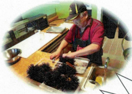
活うに・Live Uni $12 per lb