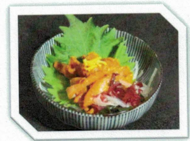
5. うにみそイカ漬 Uni Miso Ika Zuke 9