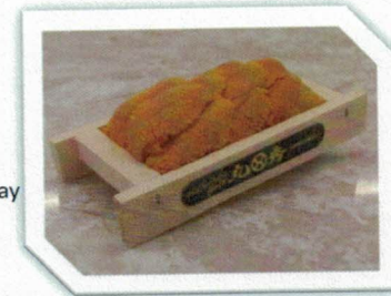
3. 無添加生うに刺身 Uni Sashimi in Wooden Tray (Additive Free) 32