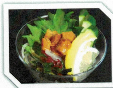
6. 雲丹酒盗数の子入り (柚子胡椒味) Uni Shutou with Herring Roe Yuzu Chili Flavor 9