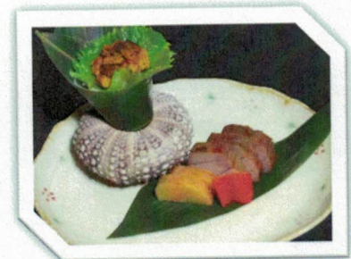
7. トロ・ウニ・沢庵のスマーク Smoked Fatty Tuna, Uni, Pickled Radish