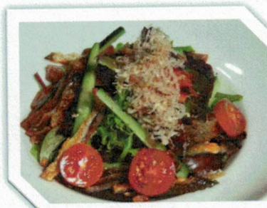
8. サーモンスキンサラダ Salmon Skin Salad 12