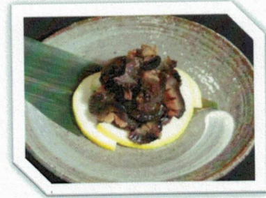
11. 酒盗なまこ Shutou Sea Cucumber 9