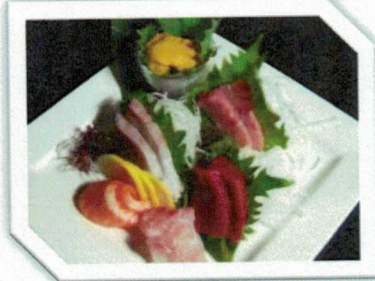
13. 刺身盛合せ (m)-5 点盛+うに Assorted Sashimi (m)-5 Kinds +Uni 45