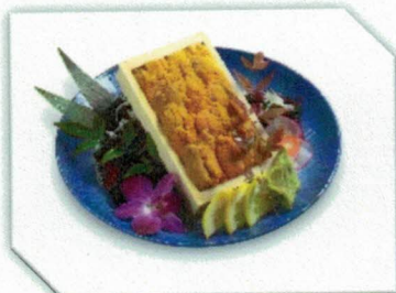
14. 特選うに大箱 Premium Grade Uni in Large Box 110