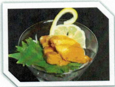
4. 雲丹酒盗ルイベ Ruibe 9